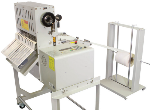
TBC552L COLD CUT